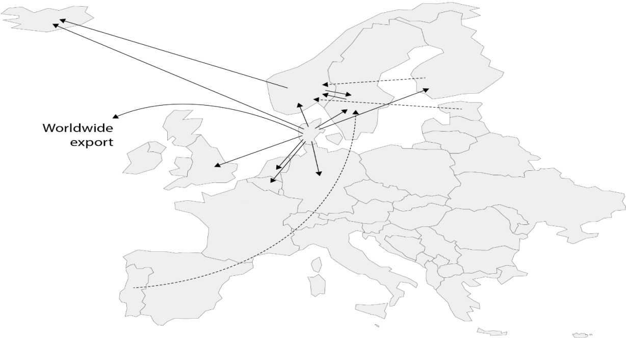
Figure 1: Examples of cross-border use of gametes in assisted reproduction in Europe

Some examples of cross-border use of gametes in assisted reproduction in Europe. International commercial cryobanks provide a substantial share of gametes in many European countries. Dashed lines represent cross-border use of eggs. Solid lines represent cross-border use of sperm. In addition, recipients of gametes also travel outside their home country for treatment.